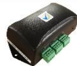
BoomBridge interface unit XBT006 for Pt100 sensor