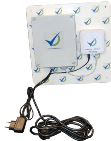
XB040-4G router (+WIN-Gateway on a mounting plate)

Use: Connect remotely located Boomerang equipment to Internet/Cloud and/or completely isolate the Boomerang system from local IT.