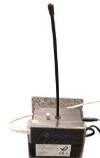
XB046 - S2GW connected to a S2 PC-Node

Use: When upgrading your Boomerang (B2) to the new Boomerang 3.0, it is common to also upgrade the Boomerang log equipment to newer versions. E.g. WIN-nodes or BBOs, having more features and being compatible with B3. However, the XB046 S2GW makes it possible to re-use the old S2-nodes. Each PC node needs to be supplemented with an S2 gateway (S2GW) that is installed on your network or via 4G mobile broadband.