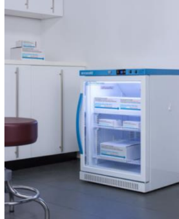
Vaccine cold storage