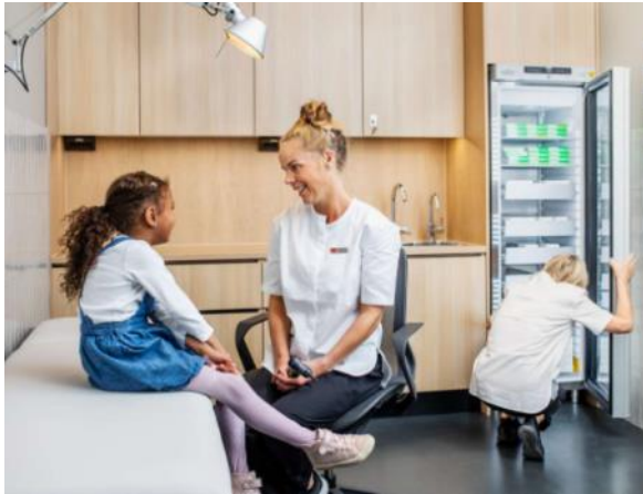
Refrigerator in health care centers